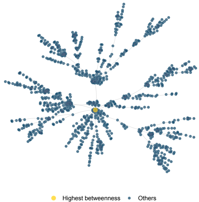
Fig. 1. Example of a preferential attachment network generated with the Barabási–Albert algorithm (30) with 1,000 nodes, one edge per node, and an exponent of 1. We focus on this network as relatively favorable to opinion leadership but in Fig. 3 and SI Appendix show other networks. The yellow node is the highest betweenness node used to test the effect of influentials.

Our control condition seeds the innovation with a randomly chosen person in the network. Our treatment condition seeds the innovation with the most central person in the network, as measured by betweenness. In most networks, betweenness is right-skewed so in our networks the most central node is anywhere from six to several hundred SDs above the mean. # We test the effects on preferential attachment networks (shown in Fig. 1) and small world networks generated in igraph (27) as well as the giant components of the Democratic National Committee email network (548 nodes and 2,442 edges), Enron email network (33,696 nodes and 180,811 edges), and a network of retweets and mentions on Twitter (532,325 nodes and 694,606 edges). We focus on preferential attachment networks in Figs. 1 and 2 but show robustness of our key finding to all these networks in Fig. 3 and SI Appendix .